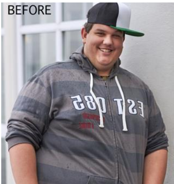
Before weight loss